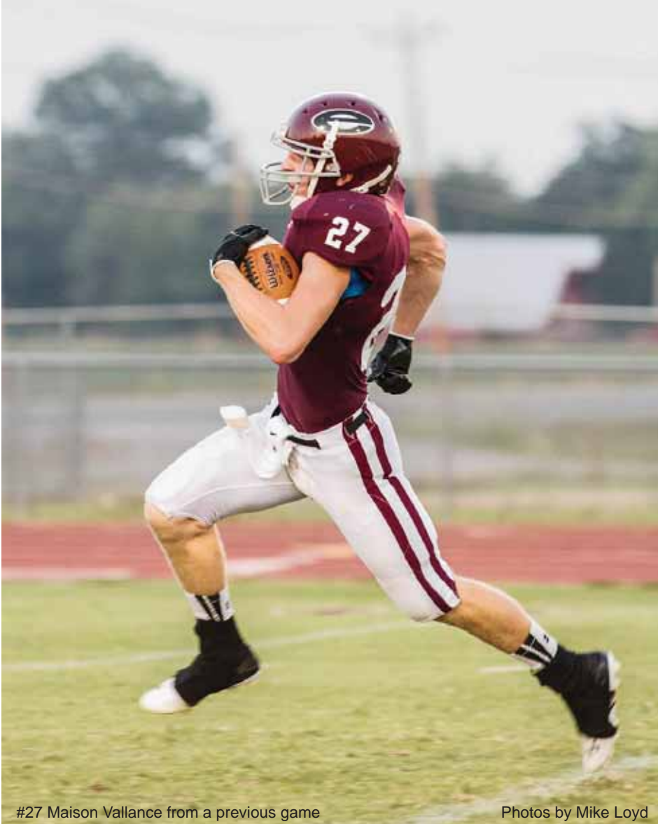
#27 Maison Vallance from a previous game