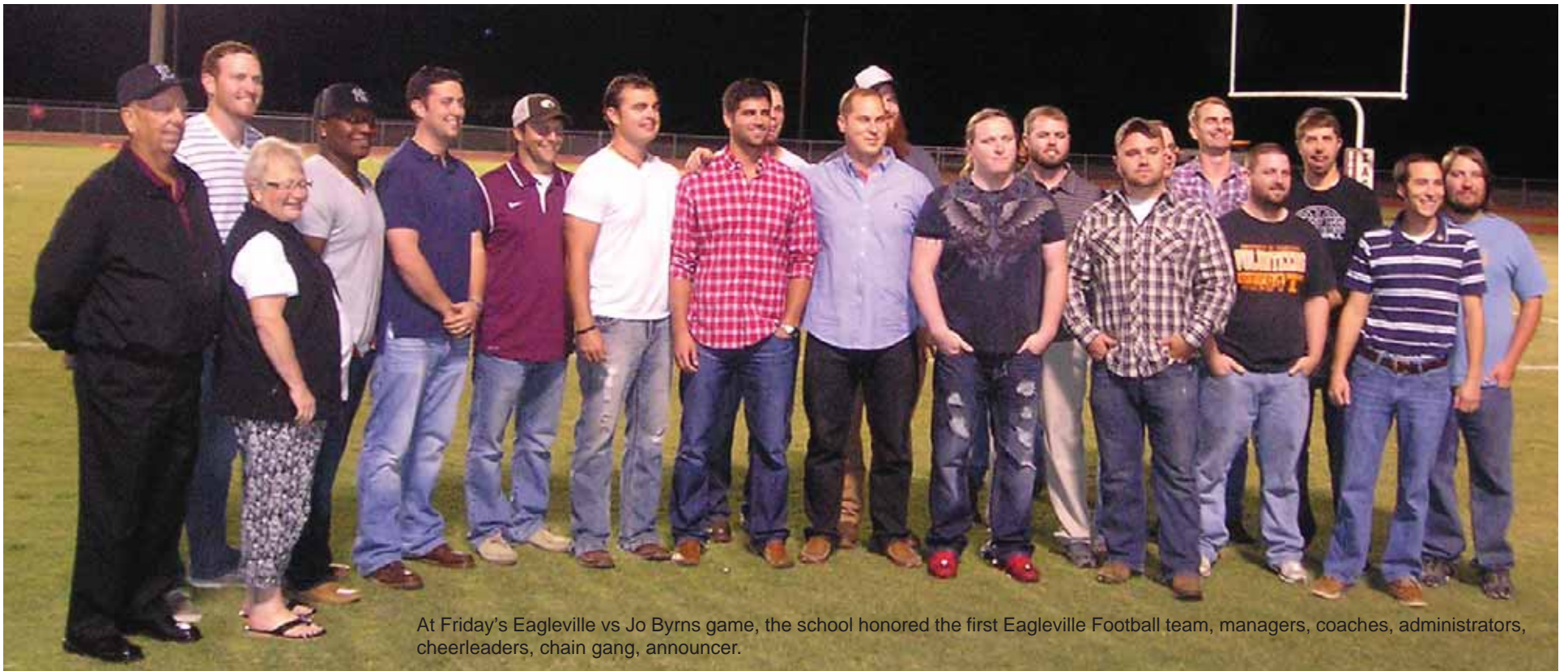
At Friday's Eagleville vs Jo Byrns game, the school honored the first Eagleville Football team, managers, coaches, administrators, cheerleaders, chain gang, announcer.