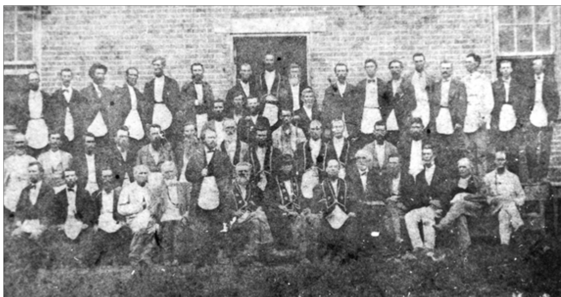
Owen Hill Masonic Lodge #172 (circa 1850)