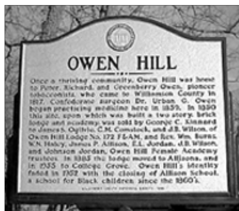
Historical Marker placed on Owen Hill Road at the 1st Owen Hill Masonic Lodge Location