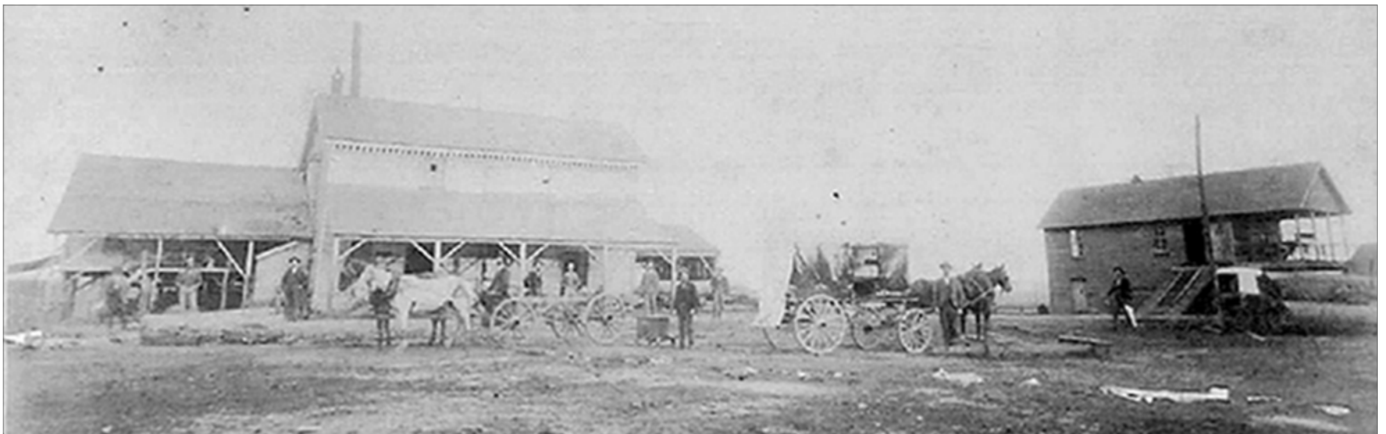
Below: Allisona Mill Co. & The Owen Hill Masonic Lodge (The Lodge Building Is On The Far Right)