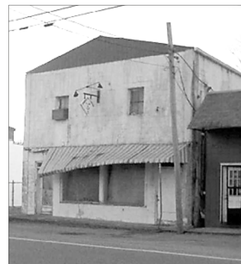
Present Owen Hill Masonic Lodge #172, located in College Grove