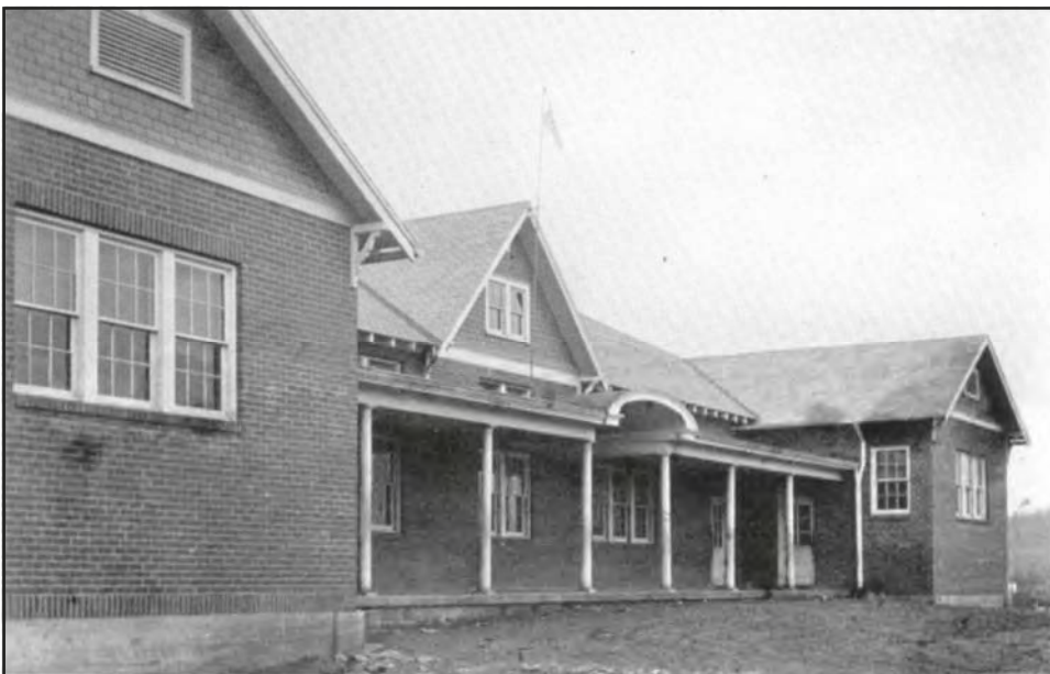
Eagleville School Built in 1924

opening of school, the school burned. It was rumored the fire was set by arsonist. After the fire the classes were held in local churches until a new brick school was built and ready for occupancy by the fall of 1924. (Continued next month)